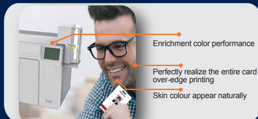
Dye-sublimation transfer printing technology

Alarm for no card, defective card slot Manual feeding card on back end and recycling pending card Available to set the direction of output card